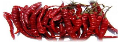
Dry Red Chillies