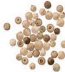
+ white pepper