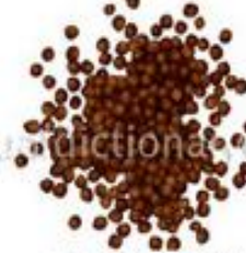
+ black mustard