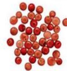
+ pink pepper