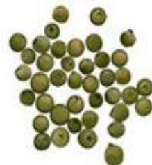
+ green pepper