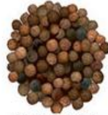
+ black pepper