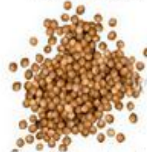
+ white mustard