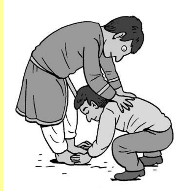
TOUCHING THE ELDERS FEET